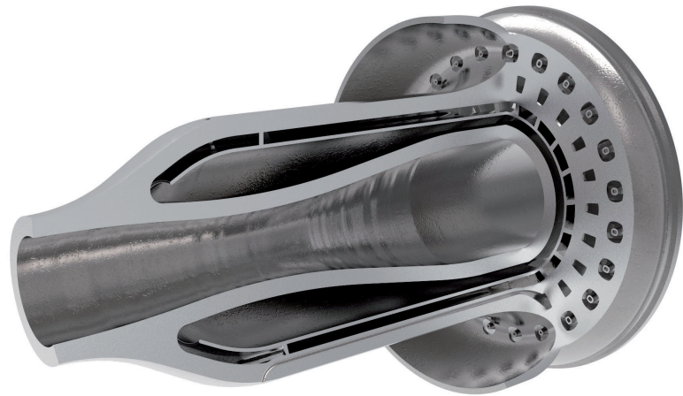
Section through a SIS injector