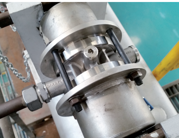
Installation of the nozzle at BIRLA COPPER

Nina Uppenkamp describes a project which has benefited from the full range of advantages provided by Additive Manufacturing: "In a copper wire rod mill, annular gap nozzles are used for wire cooling and water removal. The conventional component consisted of several parts and the air gap adjustment required the use of a shim. Setting up and properly adjusting the component involved a great effort by our customer. Our task was twofold: First, the component design was to be simplified and, second, the adjustment was to be accomplishable without the aid of a shim. We produced a nozzle by AM which requires only 35 millimeters of installation space – versus the previous 65 millimeters, weighs only 0.85 instead of 2.5 kilograms and is of mono-