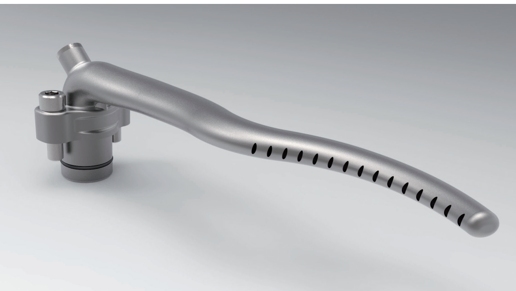
Additively manufactured roll cooling header

selective laser melting in a powder bed and the laser melting deposition process. In selective laser melting, layer by layer of a high-purity