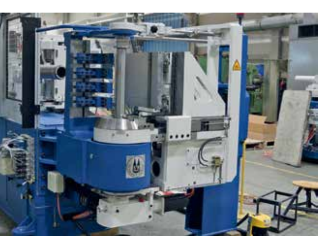
An overhauled machine: as good as a new, with state-of-the-art technology.

To buy new or second-hand? When purchasing a car, consumers tend to make their decision based largely on price. And if you happen to have a well-maintained car in the garage whose only downside is a stuttering engine, then a trip to the workshop is usually the first port of call. A similar approach can be applied to tube bending machines. Many companies have been reliably using the high-investment machines for decades. But at some stage the technology might reach its limits. In some instances, a general overhaul can be an alternative to buving a new machine. In which cases does this make sense and in which not? The tube bending machine manufacturer Schwarze-Robitec provides an overview.