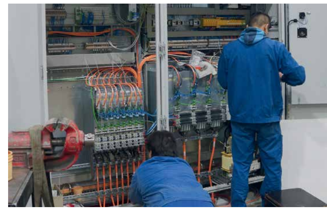
Hydraulic and electrical installations as well as the entire machine safety system are newly installed during a general overhaul. This is due to the fact that statutory safety regulations have usually changed since the machine was first put into operation.

and regular maintenance. It is therefore the combination of many factors that determines whether a general overhaul is a reasonable option: the time, the condition of the machine and the performance requirements in production.